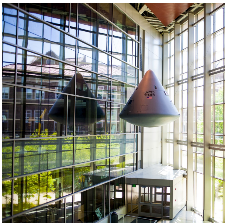
A replica of the Apollo I capsule hangs in the atrium in the Neil Armstrong Hall of Engineering, one of the conference venues.

Call for Abstracts— http://ENGINEERING.PURDUE.EDU/ASEE2018ILIN