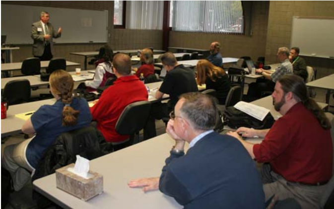
Attendees listen to a speaker on Friday

The 2008 ASEE IL/IN annual conference was hosted by Rose-Hulman Institute of Technology on April 3-5 of this year. More than 150 people attended, including faculty, industrial colleagues, and students.