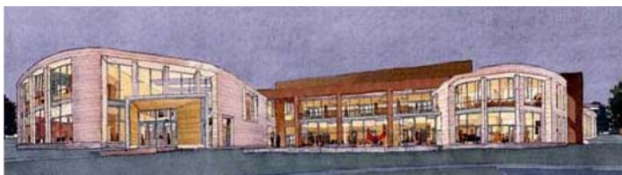
Artist's rendition of the Valparaiso University Harre Union, site of the 2009 Conference.