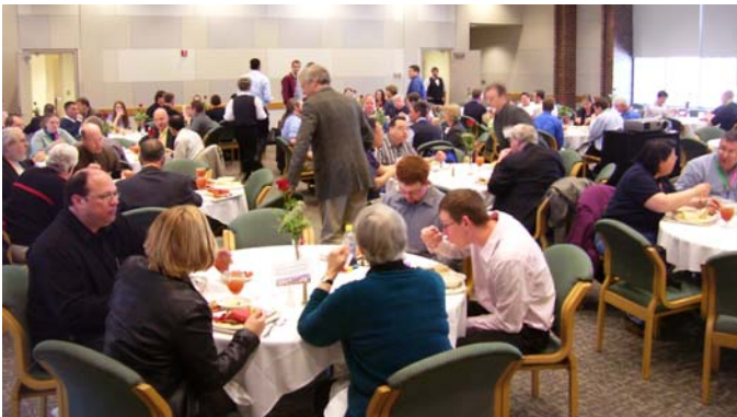
Saturday lunch in the Hulman Union